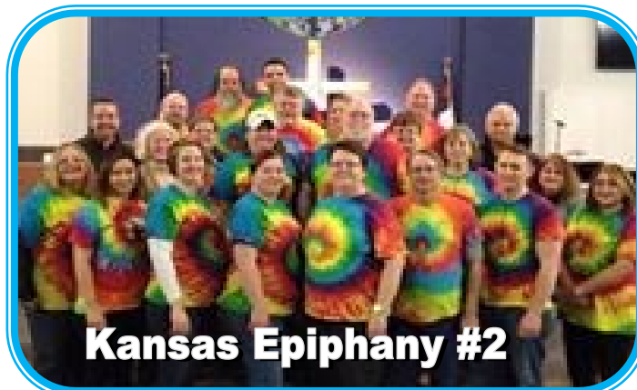
Kansas Epiphany #2