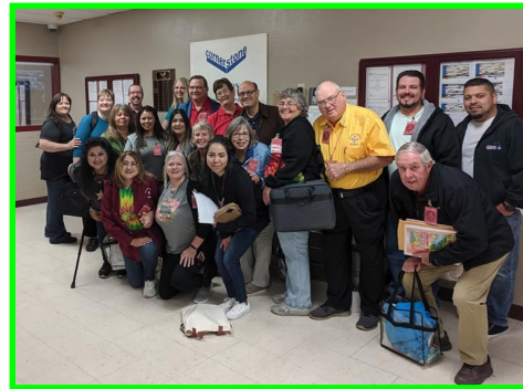
Meet Team Post #25 Best Team from the Best Weekend Ever!