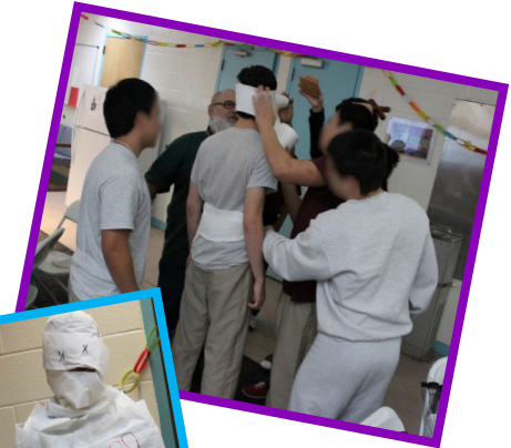
The youth competed to make the best mummy.

Religious volunteers generally conduct Epiphanies quarterly at TJJD secure facilities and mentor youth in a variety of ways, helping them to see that redemption is possible.