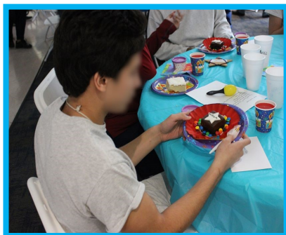
Breaks included sweet